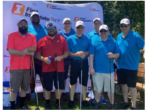
2022 Presenting Sponsor Domino's Pizza

90 dedicated golfers hit the links for the cause last June at The Dalles Country Club . The event brought in just over $20,000, helping finish the purchase of a new Linear Accelerator for Celilo Cancer Center. Join us on June 24, 2023, where fun and fundraising are par for the course!