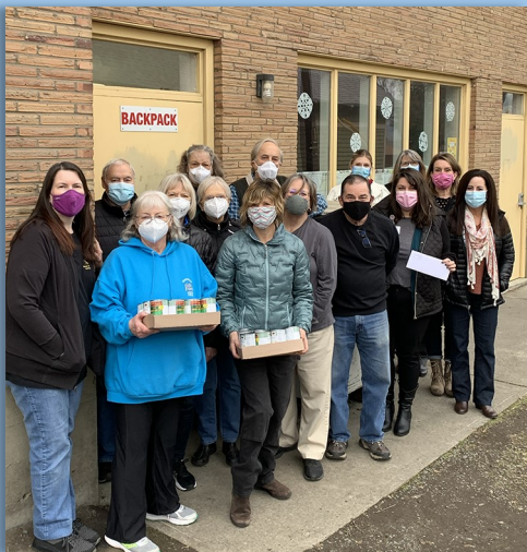
MCHF Staff & Women's Giving Circle members present an award to Community Backpack Program volunteers.

The Women's Giving Circle brings a wealth of knowledge about the needs of our community, and solutions to help address those needs, including philanthropic support. The Women's Giving Circle of the Mid-Columbia Health Foundation proudly presented two awards, generated from membership fees for 2021: