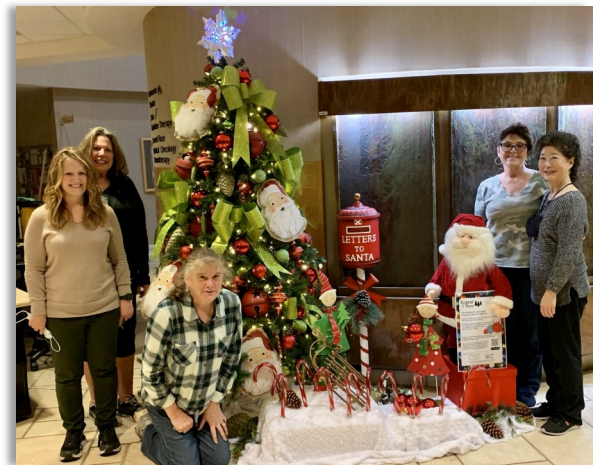
Members of XI ZETA BETA SIGMA PHI with their 2021 contribution, Wonder of Christmas