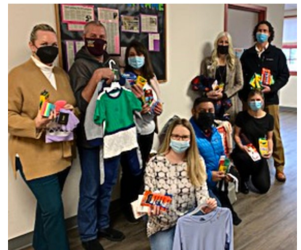
MCHF presents the North Wasco County School District with items donated for the Teacher Appreciation Drive

CONTACT US: 1700 E 19th Street, The Dalles, OR 97058 541-296-7275 | mchf@mcmc.net | www.mcmc.net/mchf