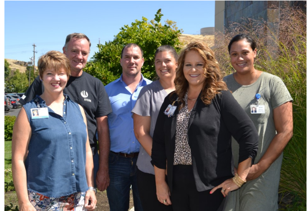
Thank you to new donor, Hydro The Dalles, for their donation to the Celilo Cancer Center Fund.

Through the Reach Out & Read Fund MCHF was able to purchase 3,587 age and culturally appropriate books for children attending Well Child exams at MCMC's Outpatient Clinics.