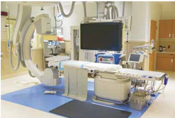
Cardiac Catheterization Lab

IT'S TRUE THAT every minute matters when responding to a heart attack or other coronary emergency. Castle Medical Center's multimillion-dollar investment in its Cardiovascular Services Department over the last two years brings new advances and expanded services, including advanced cardiac interventions and open-heart surgery, closer than ever for Windward 'Oahu residents.