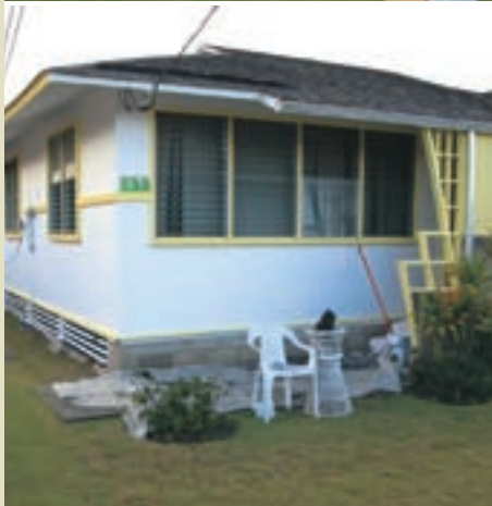
Approximately 30 Castle associates met on two weekends to complete the hospital's first Kahiau Project: replacing doors and painting the home of an elderly Kailua woman.