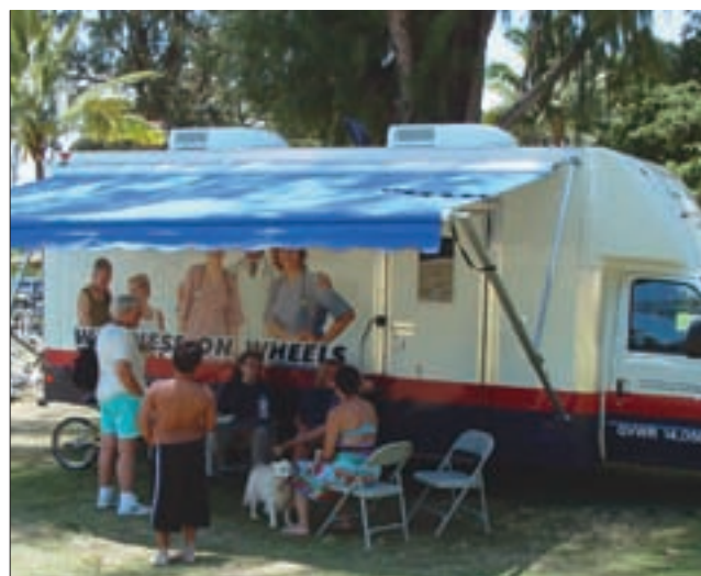
The WOW van brings health screenings and information to community members at a range of events. To schedule a WOW van visit, call 263-5050.

Looking for an ophthalmologist? Phone Castle's call center at 263-5400.