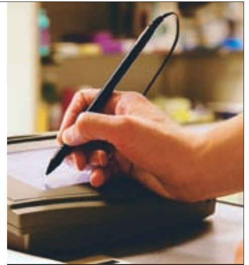
Carpal tunnel syndrome can make even simple tasks painful.

While shoulder replacement patients generally spend fewer days in the hospital than those with hip or knee replacements, they enjoy the same