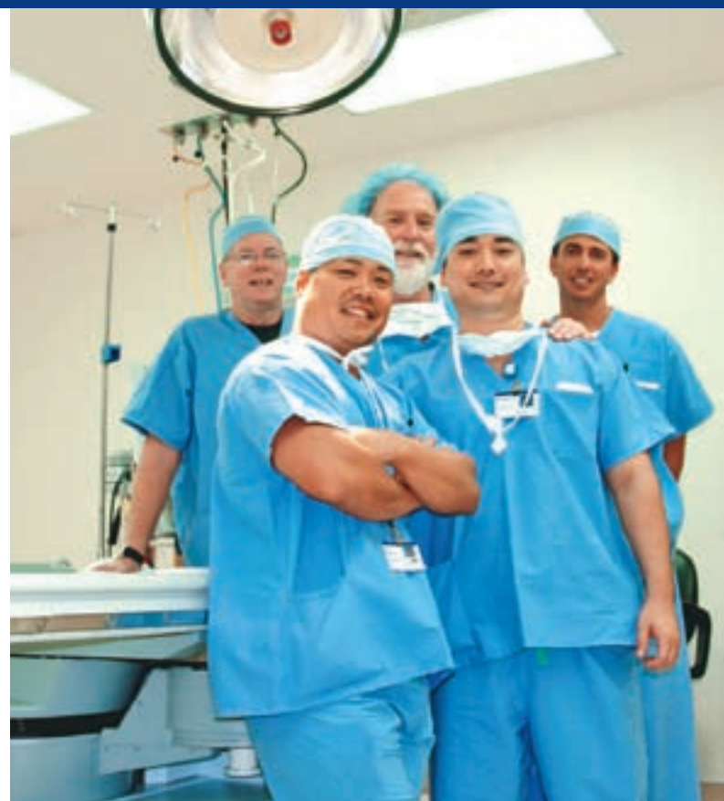
Castle Medical Center's surgery team is ready to treat kidney stones with lithotripsy 24 hours a day, seven days a week.

Performed under anesthesia, physicians use X-rays to triangulate the exact position of the stone and direct the focus of the shock