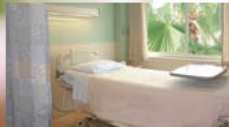
The new patient rooms have more space to accommodate visitors.