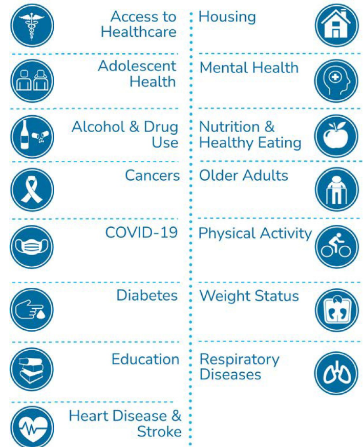
FIGURE 2. SIGNIFICANT HEALTH NEEDS

VCCHIC convened a group of community leaders to participate in a presentation of data on the 15 significant health needs. Following the presentation, participants engaged in a discussion and were asked to complete an online prioritization activity.